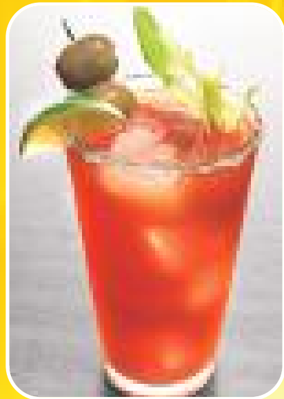
B L O O D Y M A R Y